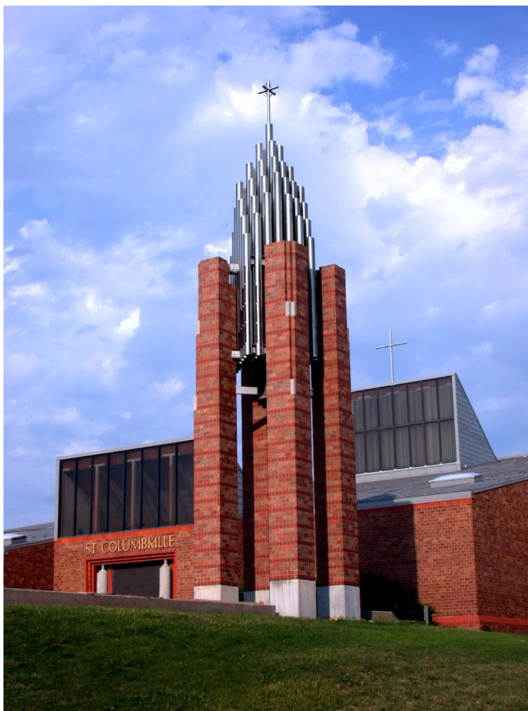
St. Columbkille Church—September 9, 2003